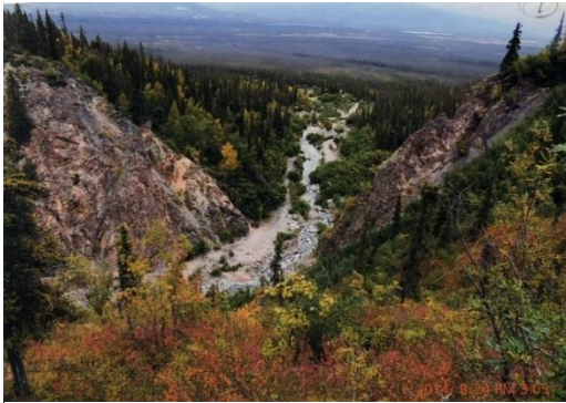
Reed Creek looking north