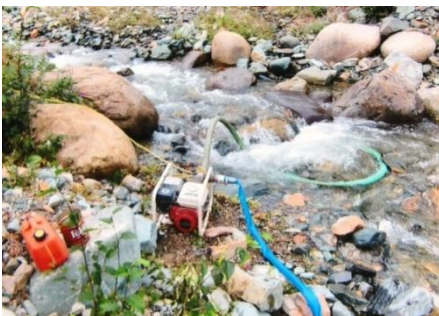
Sluice box, pump and hoses